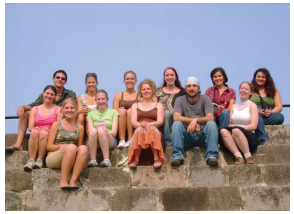
Students take a break from their studies to enjoy the sites of Cuernavaca.

One of the unique features of the full immersion program at UNINTER is that all language classes are limited to five students per class,